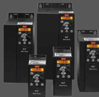
VLT® Micro Drive FC 51